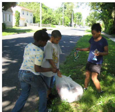
Community service: litter pick-up around Common Place