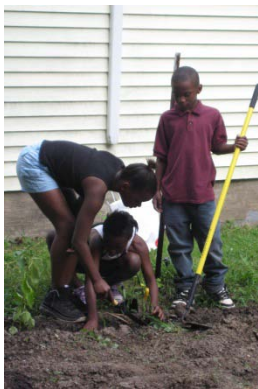
Thanks to donated seeds, plants, and monetary donations, these youth were able to learn about gardening