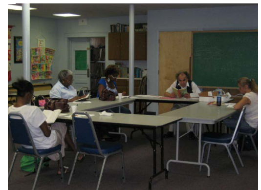
Summer Family Reading program: adults reading, Robin Hood