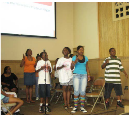
Students performing the personal pronoun jingle during the Brain Bowl