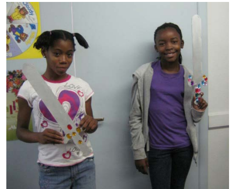
These young ladies enjoyed making their own jeweled sword as part of the Summer Family Reading program, "Summer Days and Knights of Olde"