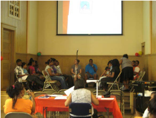
Brain Bowl teams competing

Each summer children experience a loss of core educational skills, sometimes a semester or more. This summer the youth enrolled in Common Place's Summer Work Study Program and the Summer Teen Employment Program participated in this year's educational theme of "Brain Bowl". Common Place is thankful for the Youth United for Central Illinois (YUCI) grant for helping to fund the Brain Bowl. Brain Bowl is a quiz show type setting where the Shurley English Method and basic Math Skills were studied. Every Friday the children came together in their groups to share what they learned and competed for points and knowledge rights. Many children enrolled have asked if we would use the Brain Bowl theme for next summer!