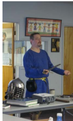
Summer Family Reading participants learn about living in Medieval Times from the Society for Creative Anachronism