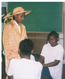
"Cab Calloway" serenades the crowd.