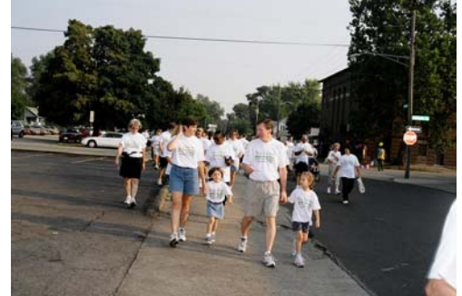
Participants walking to give children and adults opportunities to learn.

Our goal and need in 2006 is $40,000. You can help us meet our need! We need you to join us on September 9 th with registration at 8:00 a.m. and the walk at 8:30 a.m. If you are unable to participate on the day of our Walk for Reading , you can pick your own route and walk at your own convenience.