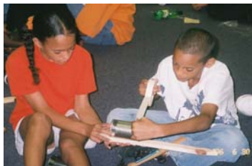
Two youth participants make their own dulcimer to take home and keep.

This summer the youth learned about their heritage through music. The youth participated in studying the history and lyrics of African-American songs through the century; war and peace songs from the Vietnam War era, they visited the Lincoln Museum in Springfield, toured the Wheels of Time Museum and saw many antique instruments; they also attended dress rehearsals of Godspell and The Wiz , and even made their own dulcimer!