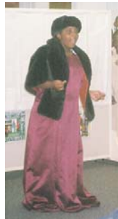
She was an American legend.

music, ranging from slave songs to dance styles of modern Hip Hop and Krumping.