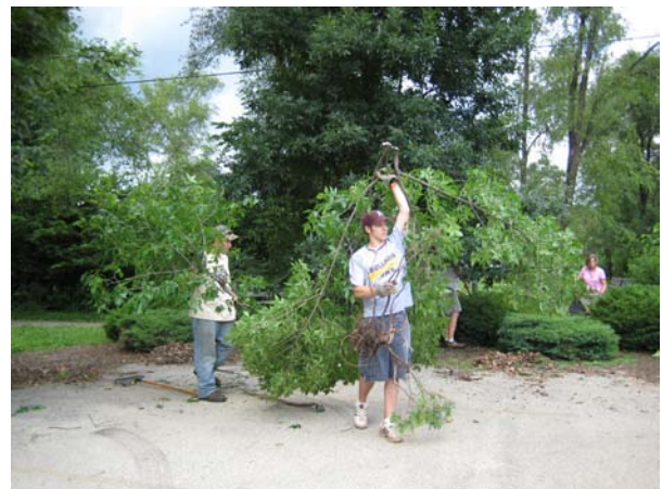
Youth volunteers from Minnesota trimmed trees around the Common Place parking lot.